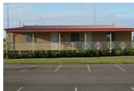
Caloundra Family History Research premises