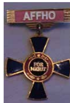
The new medallion presented to recipients of the AFFHO Award for Meritorious Service to Family History