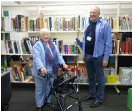
Members at the Grand Opening of new Research Room