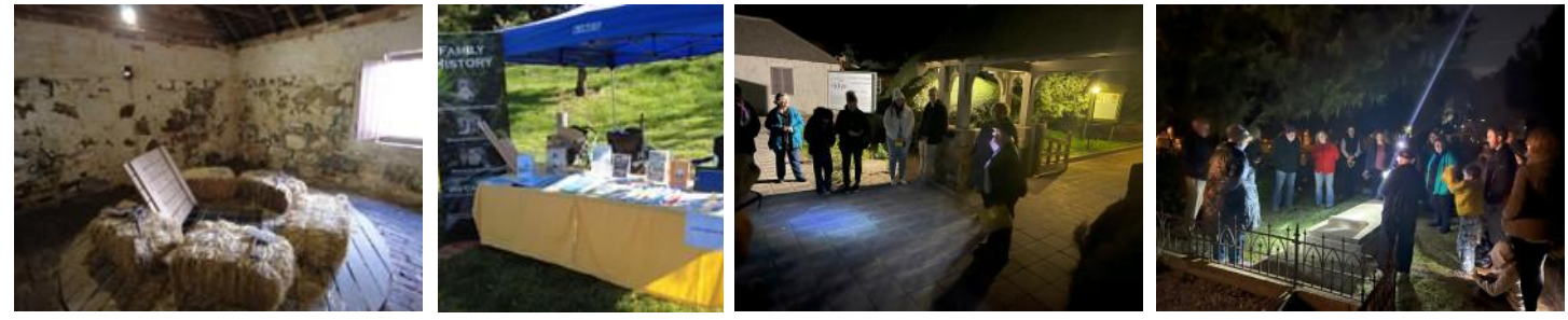
The well in the Duntroon Dairy. Family History ACT information at the Open Day.

Organising this many events required a lot of work from many of our members and we thank them all for their contributions.