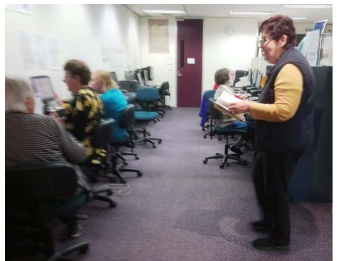
Research at the New Zealand Society of Genealogists library at Panmure, Auckland.