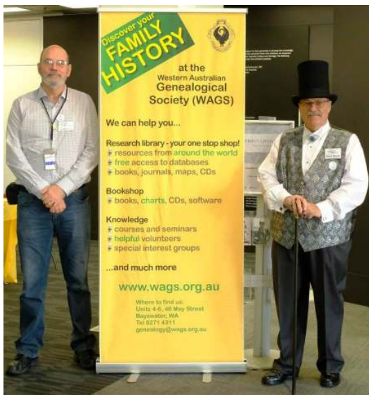
Above and top right: WAGS Open Day Right: Finding Families class at East Gippsland