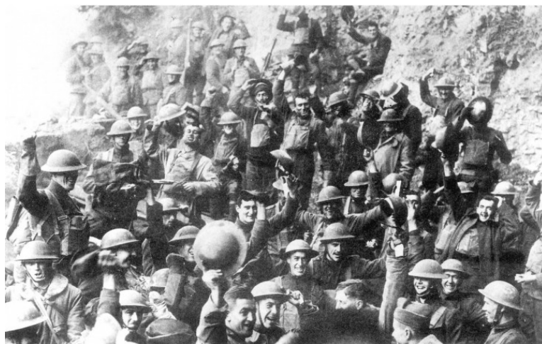
Allied soldiers celebrating Armistice Day or the End of World War I.

In memory of those who served, FamilySearch has added millions of new, free historical records to help families discover more about their WWI veteran ancestors. Search the WWI collections at FamilySearch.org . (Find and share this announcement in the FamilySearch Newsroom ).