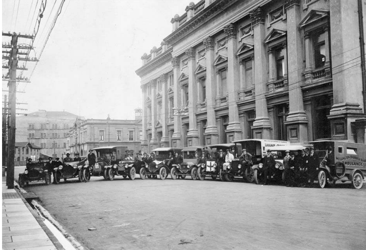
Emergency ambulances alongside the Wellington Town Hall during the 1918 flu pandemic.

In 1918 it is believed that a third of the world's population were infected with the disease and it killed 50 million people. It is said to have commenced in January, but most of the deaths occurred in October and November. Countries which carried out quarantine provisions and severely restricted sea travel escaped the horrors of the flu virus.