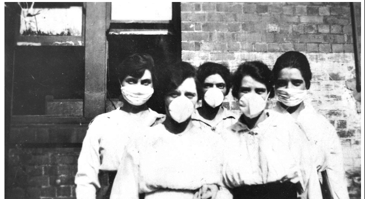
Women wearing surgical masks during influenza epidemic, Brisbane 1919.

While it is estimated that forty percent of the population had flu about 15 000 died from the disease in Australia. To put this in context the death toll was less than twenty-five percent of the First World War death toll of 62 000. The virus was spread from soldiers coming home from war. The outbreak was worse in the Indigenous population with a mortality rate of around fifty percent.