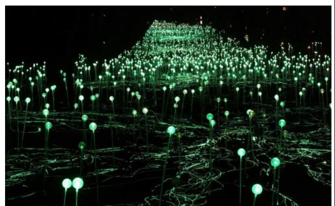
Pictures top to bottom: WAGS 40th Anniversary dinner Albany Family History Society Field of Light at Mt Clarence